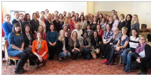
EFCNI's annual Parent Organisations Meeting